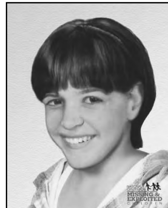
Age Enhanced Photo

Female, Age Now: 15 Brown eyes, Brown hair